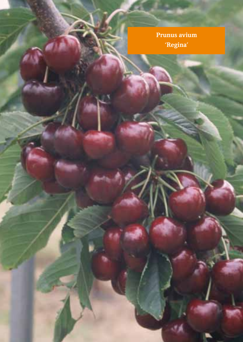
Prunus avium 'Regina'