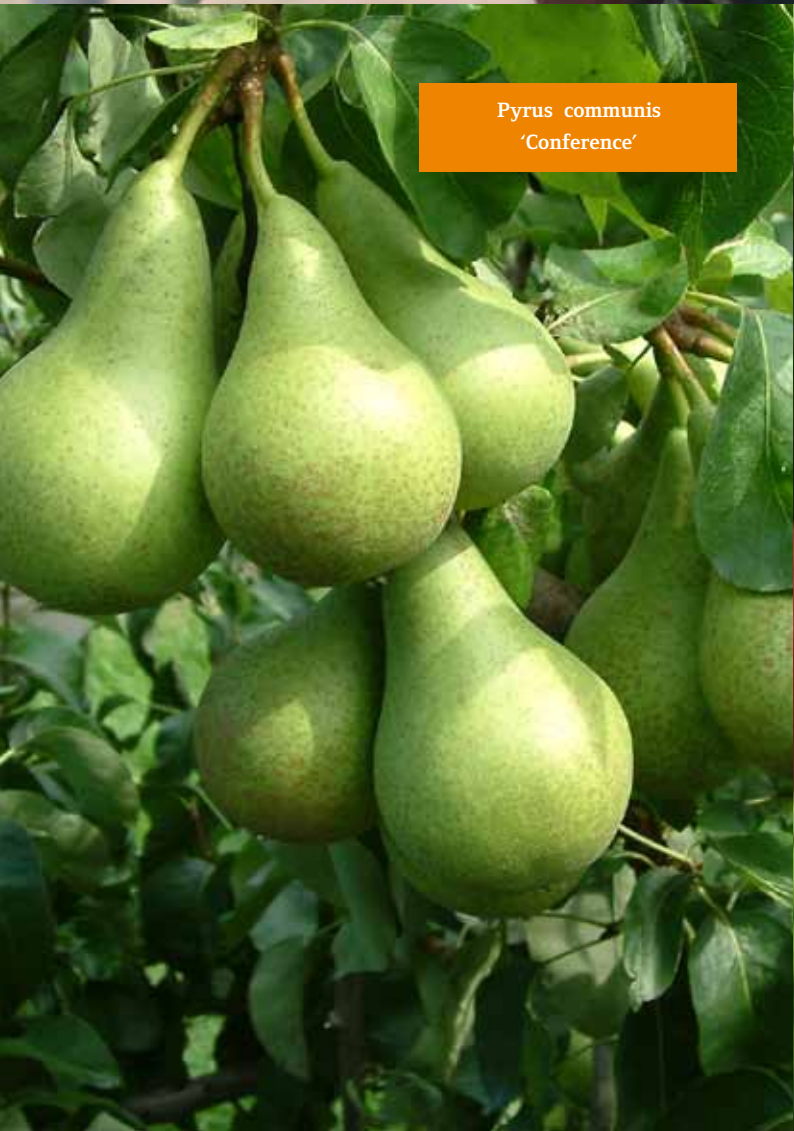
Pyrus communis 'Conference'