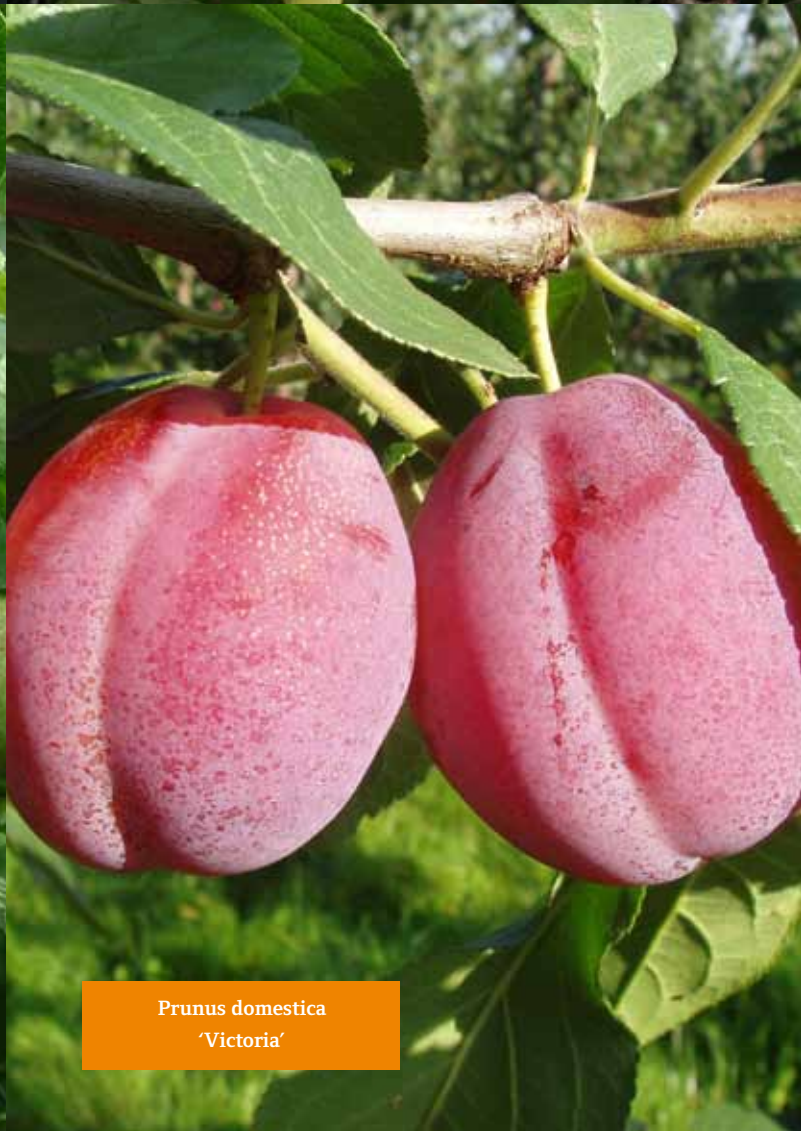
Prunus domestica 'Victoria'