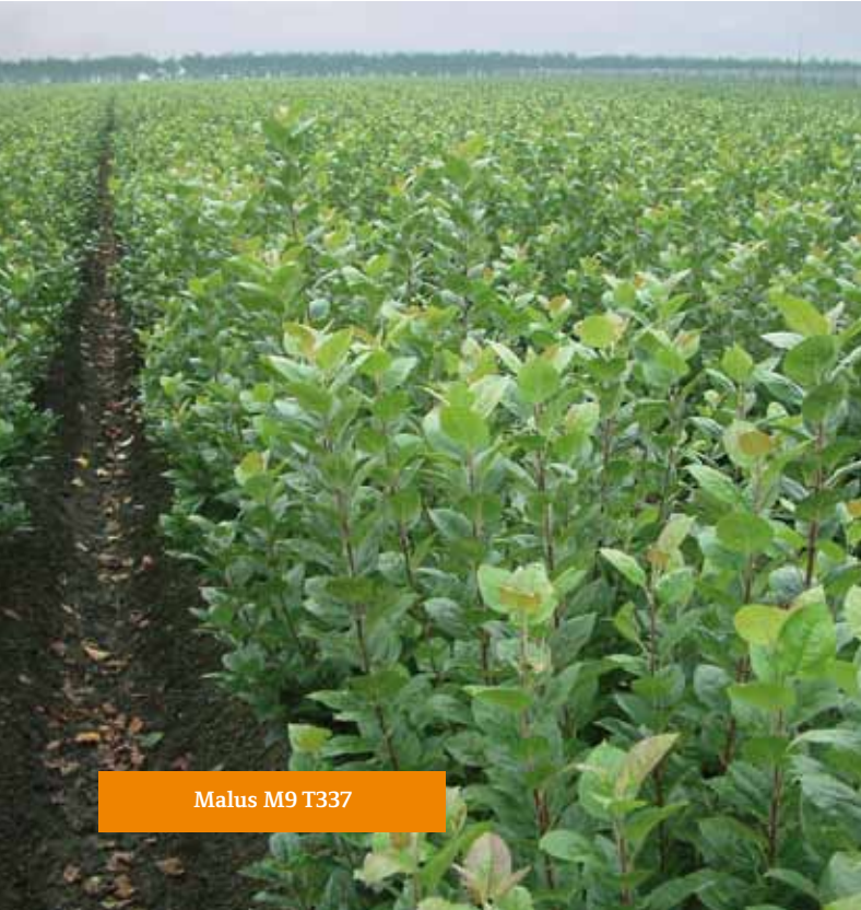
Malus M9 T337