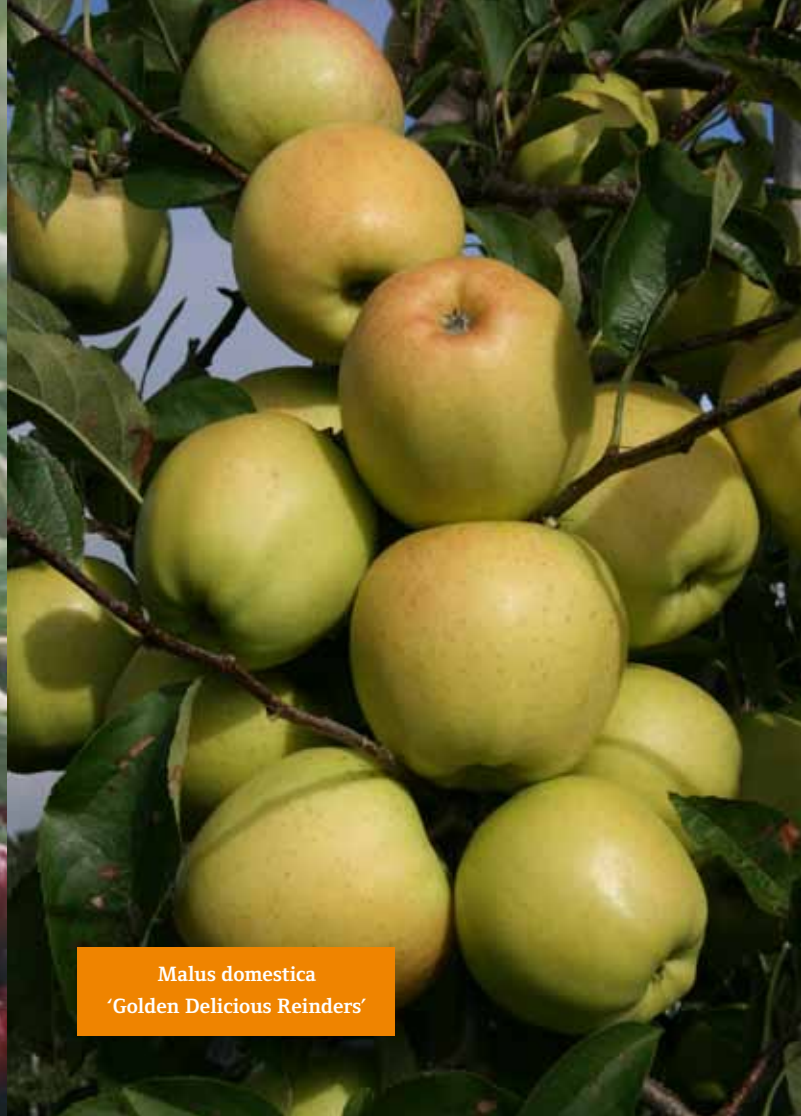
Malus domestica 'Golden Delicious Reinders'