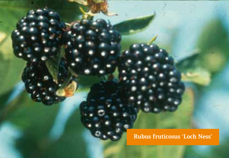
Rubus fruticosus 'Loch Ness'