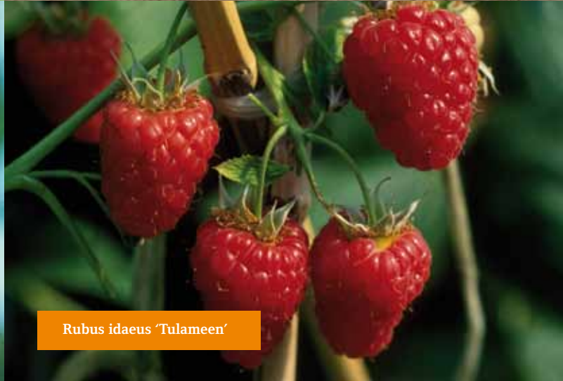
Rubus idaeus 'Tulameen'